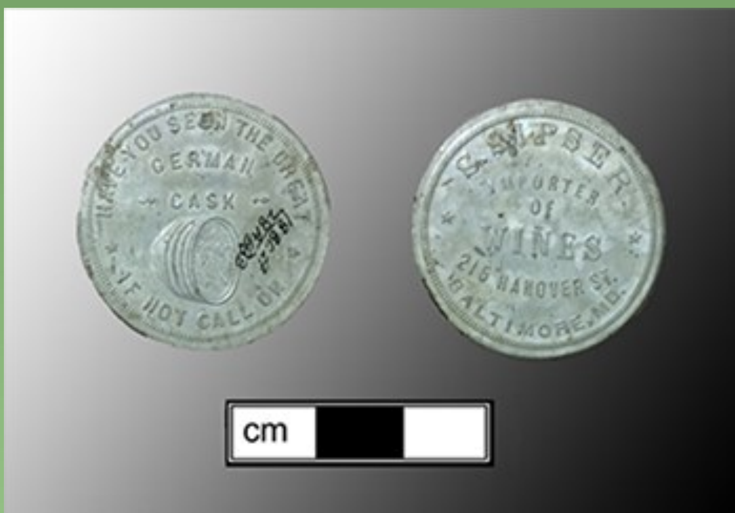
Figure 1. Aluminum token from S. Sipser Wine and Liquor Merchant.

Great German Cask &ndash; If Not Call On" (Figure 1). The holder of the token would presumably flip the token over to learn the name and address of the business where the great cask could be found. Sipser's business stationery listed him as a direct importer of German and French wines (Figure 3), so it is likely that the cask referenced on the token held German wine. The finest German wines were fermented in casks, with the best results obtained from very large casks—the famous Heidelberg tun measured 31 feet long by 21 feet in height (DeColange 1880:445). Some of these casks were elaborately decorated, as suggested by the cask shown on the token. Searching through Baltimore newspapers of the turn of the century did not reveal any items about Sipser's promotion, but it is likely that the cask was large enough to attract potential customers into the shop.