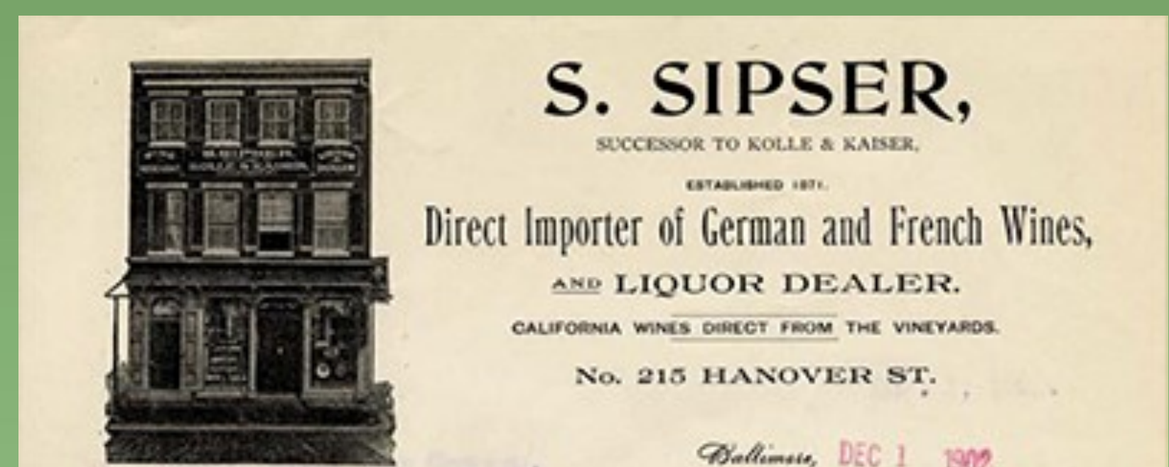
Figure 2.

Sipser produced other promotional materials, like stoneware liquor jugs in various sizes (Figure 2) printed with the business name and address. The opposite side of the Sipser token sports an image of a wooden cask, along with the words "Have You Seen the